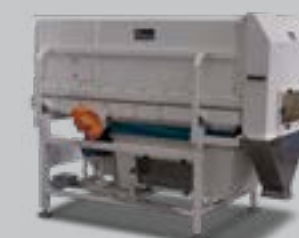
EXCEPTIONAL PERFORMANCE COOLER Couscous temperature always adequate to the consecutive phases.