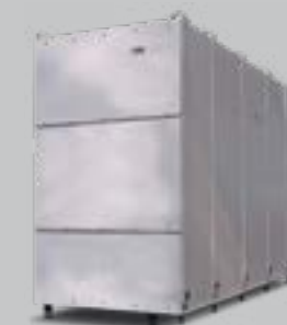
PERFORMING DRYING Simple and balanced, thanks to the rotating item used.