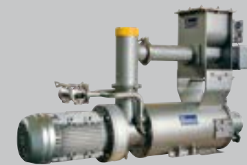
PREPARATION OF THE MIXTURE BY MEANS OF THE PATENTED SYSTEM PREMIX® The best pre-mixer in the world: quality, no compromise.