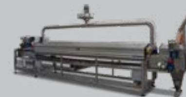
COOKING PHASE METICULOUSLY LOOKED AFTER Thanks to our vapour injection system, homogeneous cooking is guaranteed.