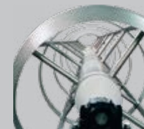
ORIGINAL METHOD OF SIFTING No lumps wider than the diameter chosen.