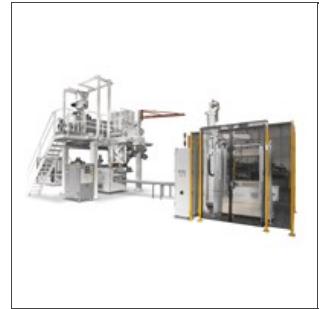
180.1 Press on short-cut pasta line