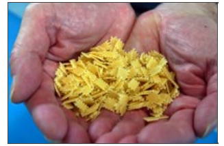
Quadrucci forming machine - detail