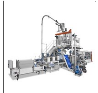
Quadrucci forming machine on short pasta line