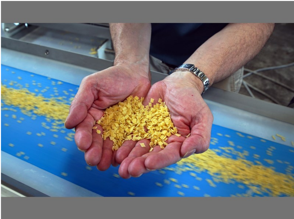
Detail of quadrucci