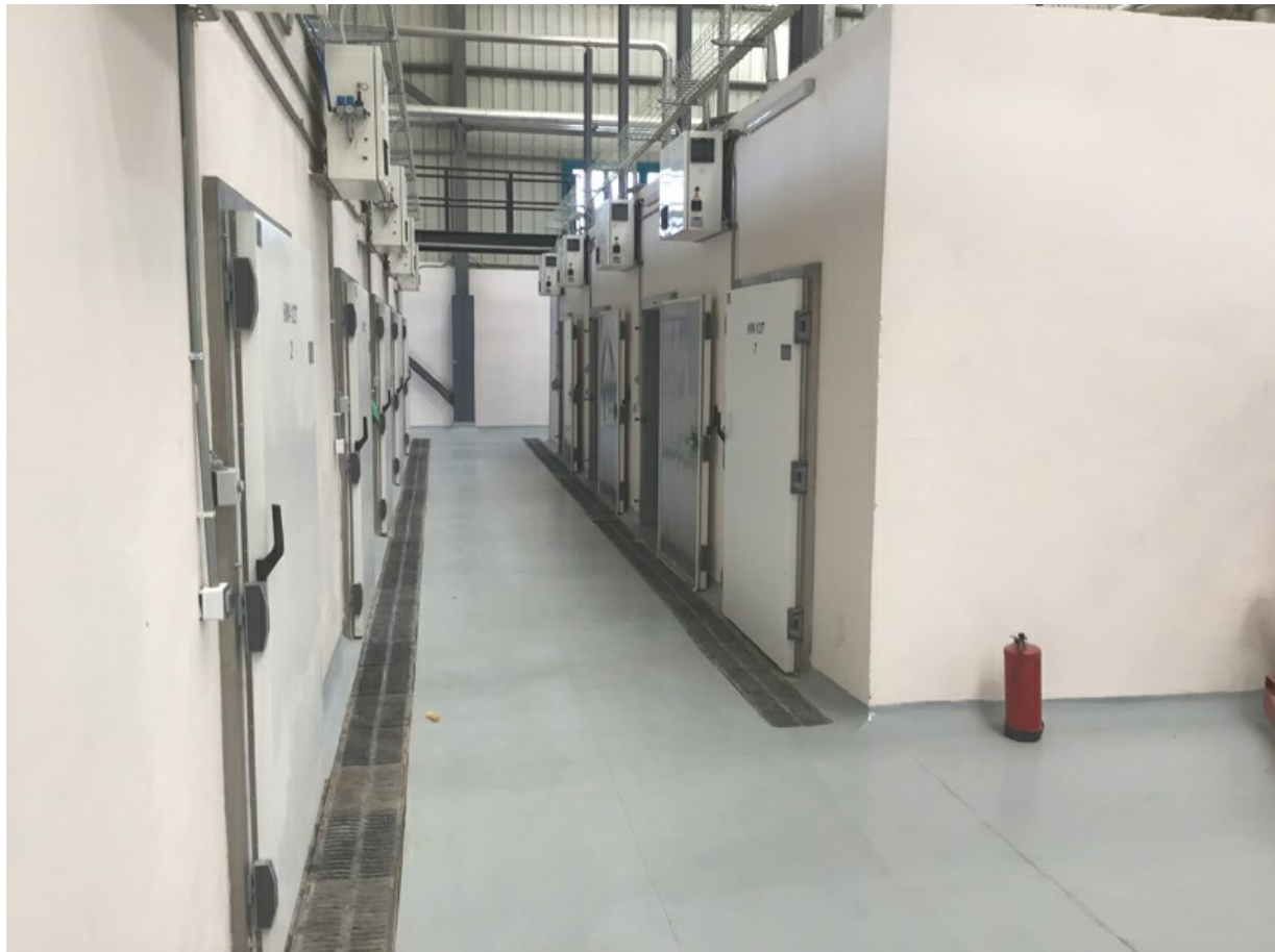
Kit for static dryers