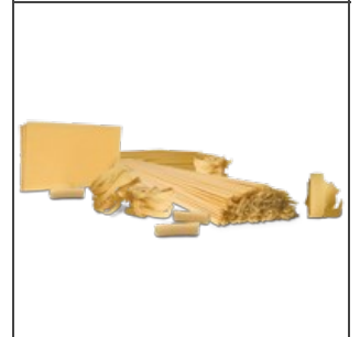
Drying for all pasta shapes