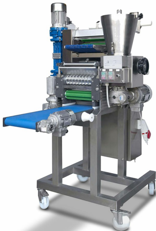
■ Ravioli forming machine RC 250-300 AR