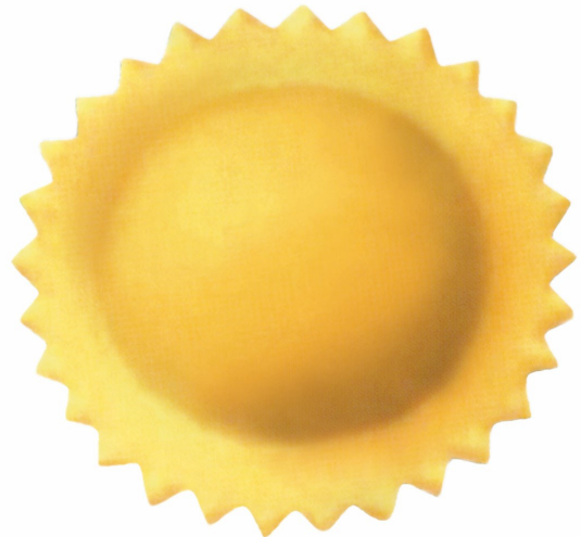
■ Double sheet round ravioli