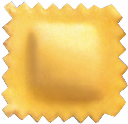
■ Double sheet square ravioli