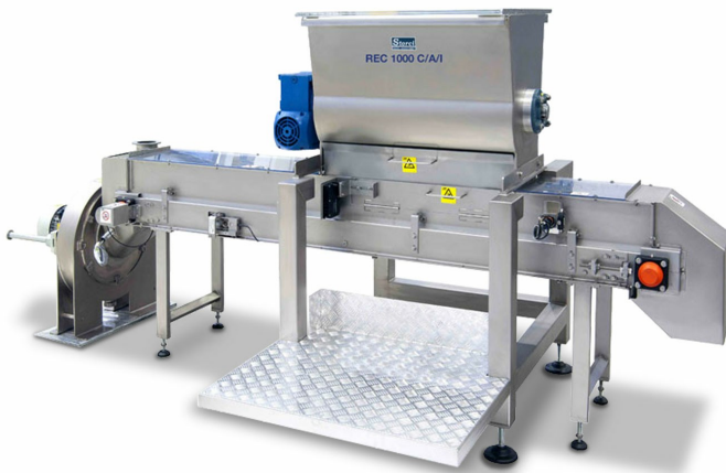
■ Rec 1000 C/A/I