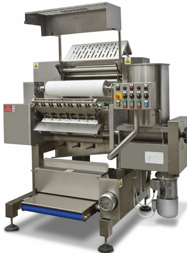
R 540 C