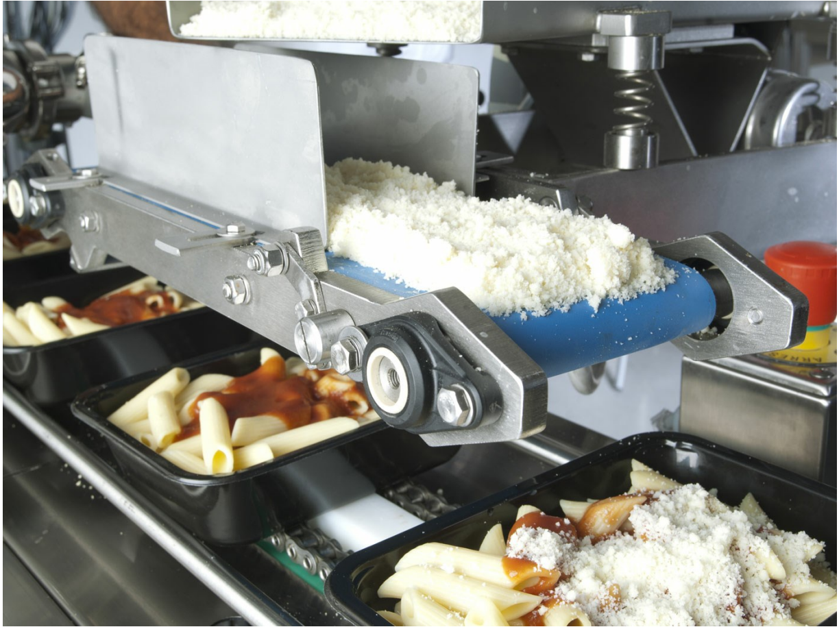
■ Detail of the grated cheese doser