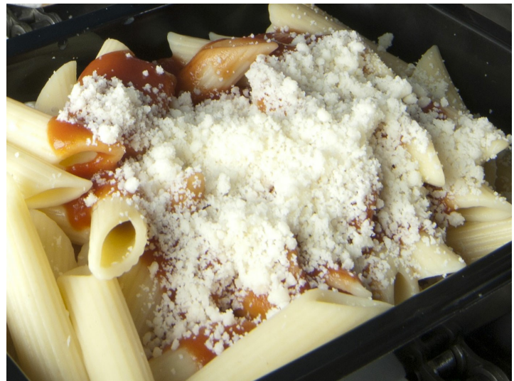
■ Grated cheese on pasta