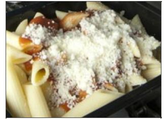
Grated cheese on pasta