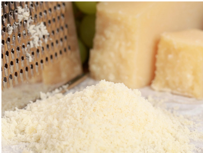
■ Parmigiano Reggiano

Hot news for our ready-to-eat lines: thanks to our recent collaboration with the BS company from Parma we have been able to create innovative and creative solutions (ready-to-eat lines) for preparing ready-to-eat lasagna and cannelloni. For over 30 years BS has been working with expertise and reliability in the most important ready meals, fast foods, ice-cream and confectionary markets. These are added value products designed to help you make profits and we are here to offer you the best personalized solution and best ready-to-eat lines.