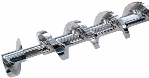
■ Closed compression worm screw