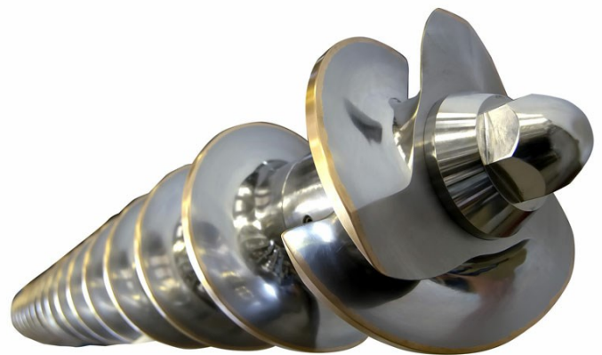
■ Worm screw