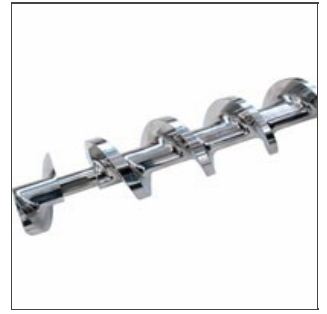
Detail of a closed worm screw