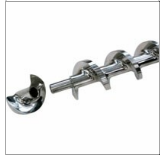
Detail of an open worm screw

We have acquired a cognitive map and consequently a far-reaching understanding of these machines acquired over the years; all this makes it possible for us to make high level technological improvements whenever necessary and state that the name Braibanti remains (also thanks to us) a synonym of indestructibility.