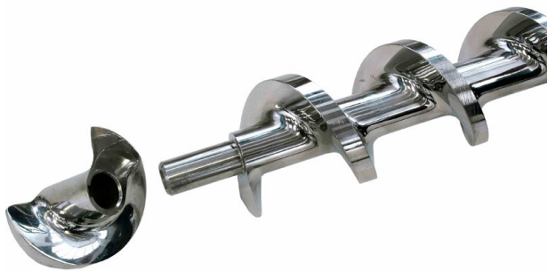
■ Open compression worm screw