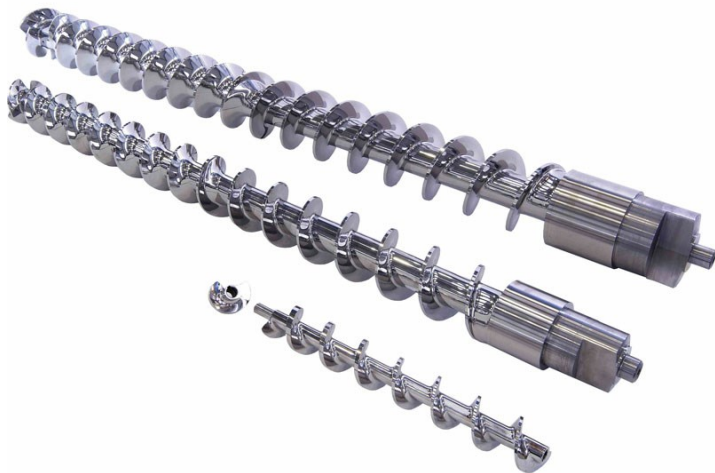
■ Compression worm screws