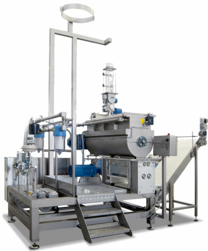
VSF TV/MIX with automatic mixing system