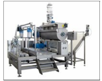
VSF TV/MIX with automatic mixing system