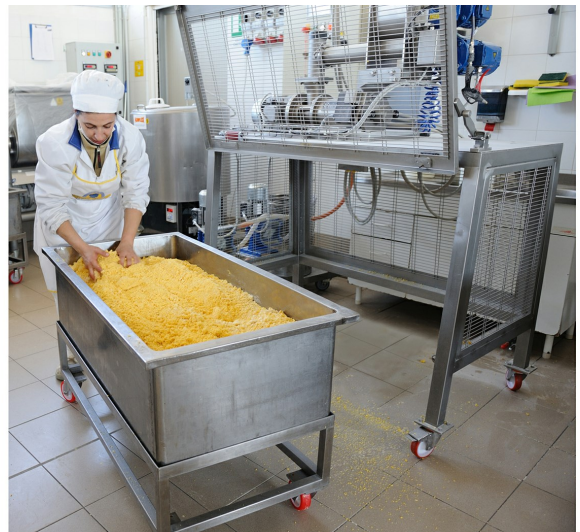
Trolley-mounted tank with dough